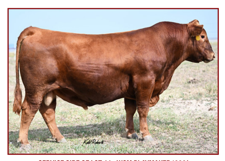
SERVICE SIRE OF LOT 44 - WSM PLAYMAKER 1080J

Stout big ribbed easy keeping cow that is dark cherry red what more could you ask for bonus points is that she is halter broke and easy to handle. Confirmed bred AI to performance bull WSM Playmaker 1080J (RAAA #4468115) for a 9/23/24 "heifer" calf