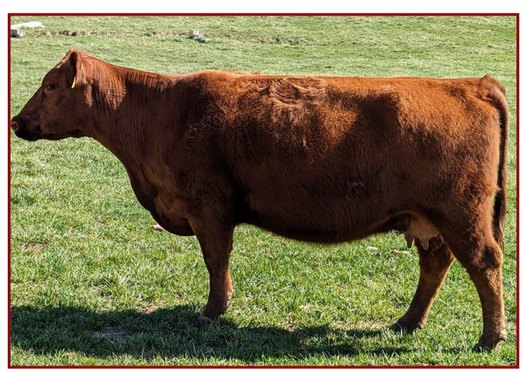
LOT 41 - TW ROSIE 960G