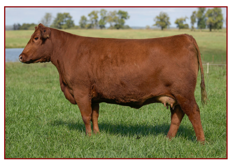
DONOR DAM LACY LAKOTA 8190 326

This embryo package combines the style & maternal traits of one of our most proven donors, Lakota 326 and the real-world performance of LACY 1776 002D. The dam is a beautiful uddered, moderate framed, easy fleshing cow that does nothing but produce. She herself is the daughter of our historic donor cow LACY Marie 8190 and maternal granddaughter of VDAR Rebalas 401. Selling one package of 3, conventional embryos with a guarantee of one 60-day pregnancy if implanted by a certified technician. FOB Show-Me Genetics | Strafford, MO