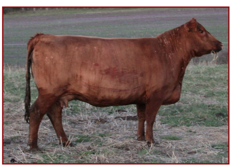
LOT 45 - FRY FORK WARRIOR F810

Warrior F810 is a big bodied easy keeping that produces one of the top calves in our program every year. She is pasture exposed to RFIF Mission Nexus 204H ET. Reg#455135