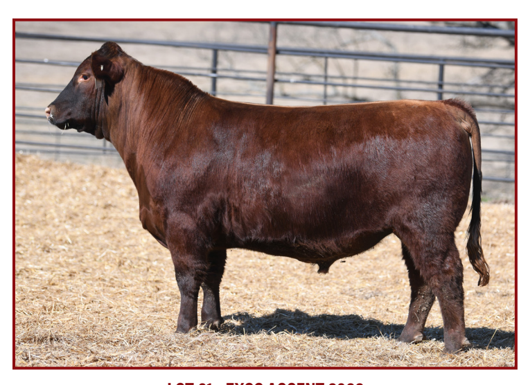
LOT 61 - EXCC ACCENT 2088