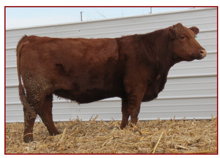
LOT 48 - 1PF COPPER LADY 80