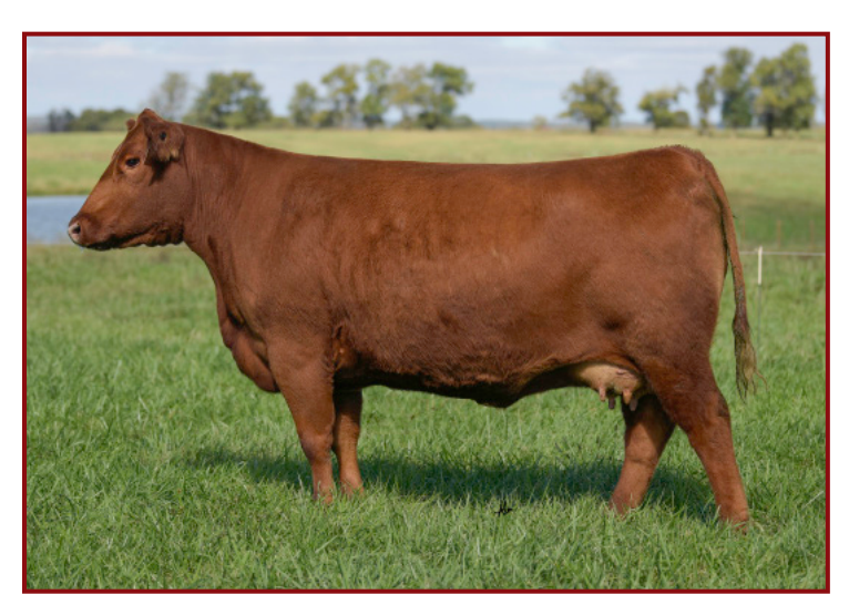
DAM OF LOT 34 - LACY LAKOTA 0251 326