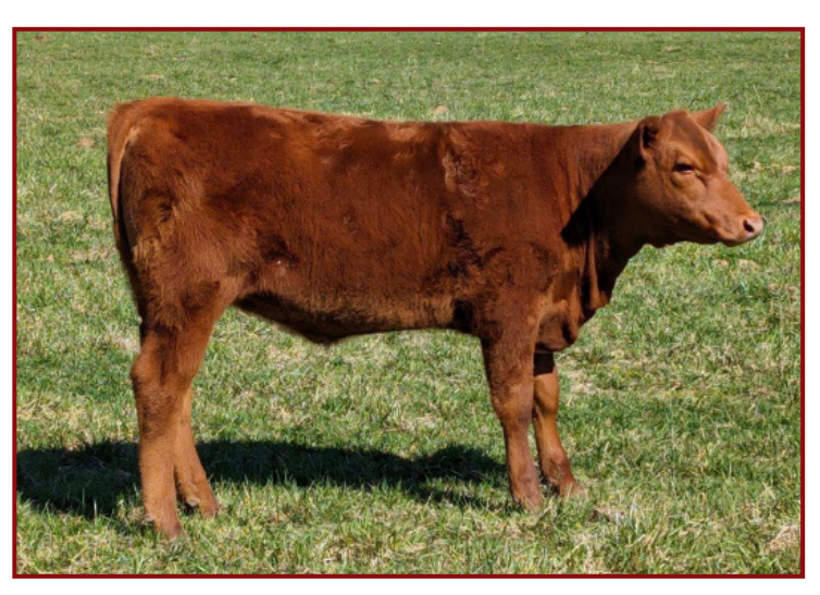
LOT 19 - MARTIN'S ROCHELLE 07X1K