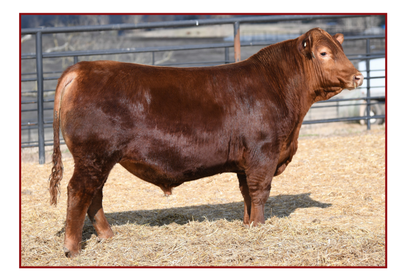
LOT 58 - EXCC QUARTERBACK 2082

EXCC Quarterback 2082 ranks in the top 4% for Yearling, top 5% for Weaning and top 3% for Milk. This bull will no doubt be an asset to any program. 2082 is a prime example of why Quarterback cattle are so hightly sought after! This bull is big footed and super deep bodied. He will make high weaning calves and great replacement females.