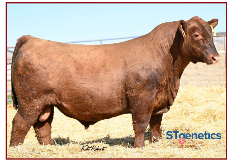
SERVICE SIRE OF LOT 49-53 - LSF DLL LOCOMOTION

Al bred to LSF DLL Locomotion (#4620365) for a 10/01/24 Heifer calf. Note: Last several years cow has been in Akaushi Red Wagyu program.