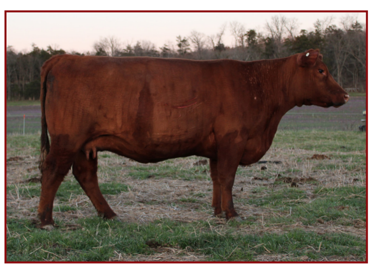
LOT 42 - KFF EMULOUS 0039