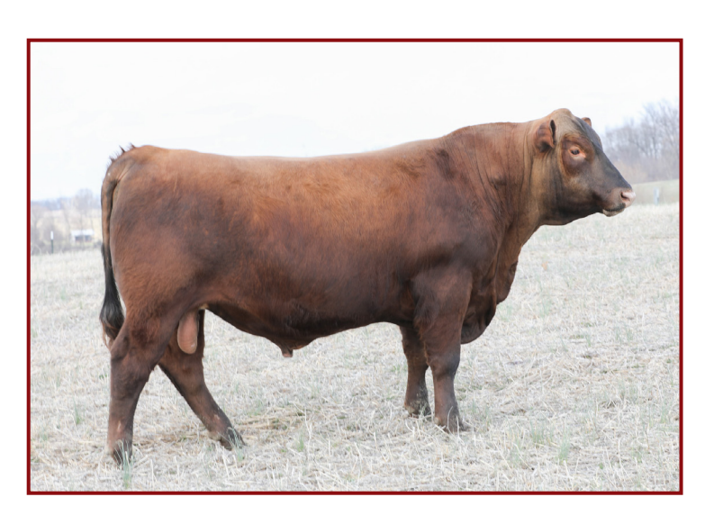
LOT 59 - BROOKSIDE'S ONE UP K24

K24 is dark red, slick haired, PIE ONE OF A KIND 352 son that any cattleman who appreciates extreme performance and growth will be able to find on sale day. K24 is a standout in power and performance while still carrying a manageable BW and CED. He stands on a perfect set of feet and is so extended in his spine he will add length and pounds to your calf crop. K24 is in the top 1% of the breed for YW and top 2% for WW and ADG. This is a true cattleman's bull we are thrilled to offer.