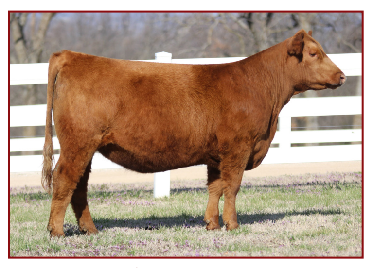
LOT 24 - TW KATIE 268K