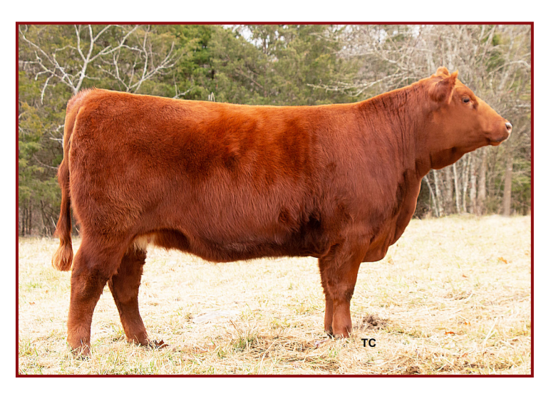
LOT 35 - SL MS ALLEGIANCE 2207