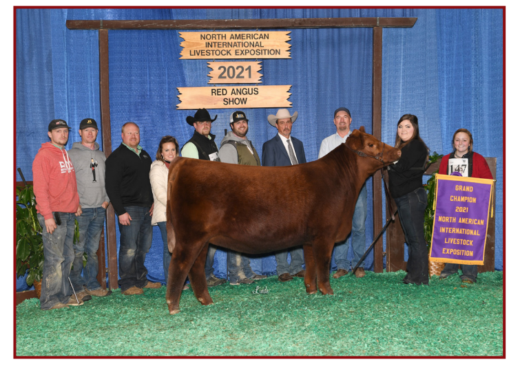
DAM OF LOT 24 - TW ANNIE B 064H