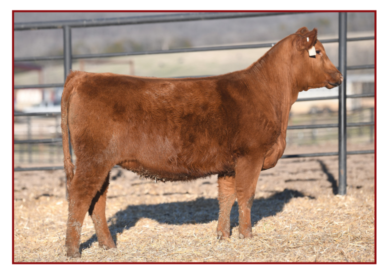
LOT 4 - EXCC DELLA 3082