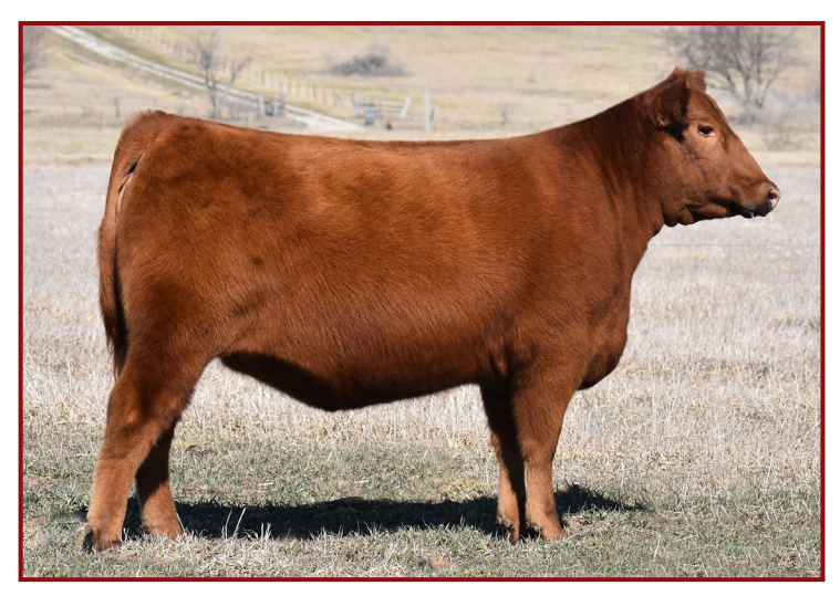
LOT 21 - LACY LAKOTA 078C 061K

We had every intention of keeping Rita back in our program; but we wanted to offer one of our best. Sired by Red SSS Gravity 296E and backed by a tremendous black-red carrier dam, 250K is loaded with maternal, and fleshing ability with excellent feet. One of the most exciting features of this heifer is she carries the service of our up-and-coming herd sire TW Jackson 261K (4738983). Jackson is a Red Box out of J6 Guinevere 106G. Making him a full brother to the 2023 American Royal Champion Female. Confirmed Safe to PE 12-27-23 to 2-15-24.