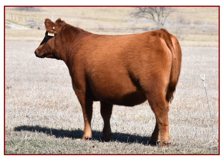
LOT 21 - LACY LAKOTA 078C 061K

family. She combines eye appeal with all the pieces of a functional brood cow & would fit in any operations front pasture. Her EPD profile hits all the sweet spots with top 25% ProS, top 29% HB, top 15% CED, top 17% BW, top 28% WW, top 20% YW, top 14% ADG, top 28% Milk & top 9% HPG. She comes halter broke & sells AI bred to 9-Mile Franchise 6305 (#3555188) for an 8/26/24 Heifer calf.