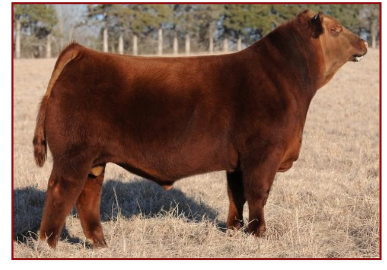
SIRE OF LOT 15 - RED SOO LINE POWER EYE 161X

People called this heifer's dam a bull maker, but we were not upset when she had this heifer. Stout, big-boned, long-spined, and square when you get behind her, JL Lana Lynn 9693 is as much a bull maker as her dam. Gentle and already kid-broke, she'd make a fun county fair project, then kick her out to pasture and make an awesome replacement out of her.