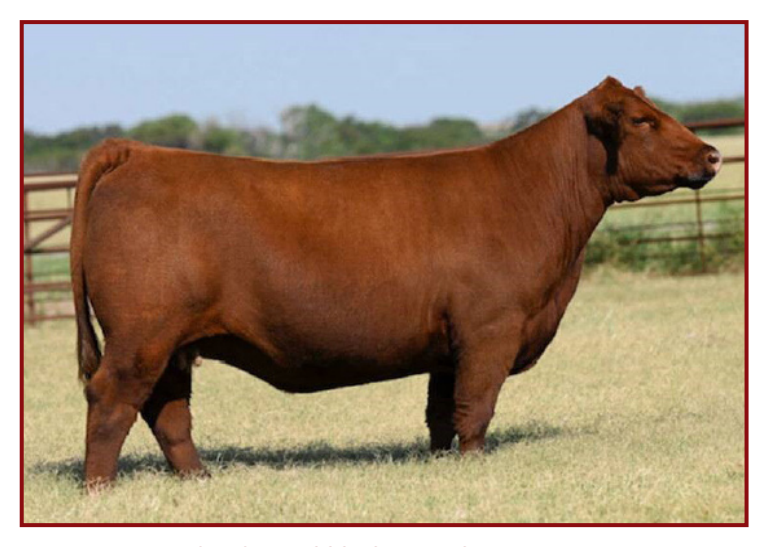
DAM OF LOT 13 - SSST SHANNAS ALAYNAH 185F

Stout moderate framed female out the the great poteet cow family out at Pieper Red Angus. This female is halter broke and is first year showman approved.