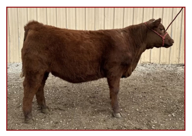
LOT 16 - ORY STAR BRIGHT LO3G

Halter broke very calm ready to show. Good project for younger showman.