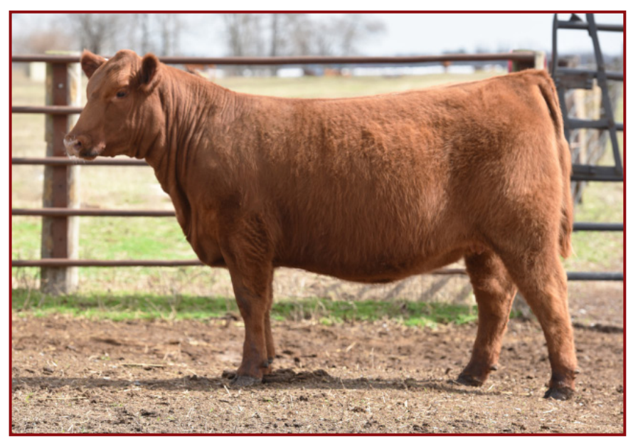
LOT 1 - SGC MISS ESSENCE 7L