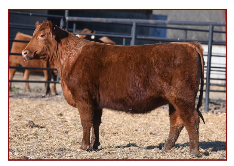
LOT 33 - EXCC ROBIN 2075