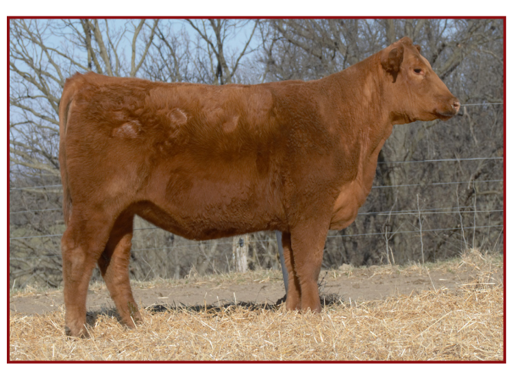
LOT 23 - BRAX MISTY 2252

After some cussing and discussing we decided to offer up one of our favorite bred heifers. Sells Al'd to PIE Centerfire 2064 (brother to the $400,000 PIE Hollywood 222) due 9/9/24 (PE'd to EXCC Franchise 1123). This heifer is stunning to look at in person and on paper. There is no doubt she is a future donor! Explosive Cattle Company is reserving the right to 1 flush at the buyers convince and our expense. Make sure to be there sale day, you will want to lay eyes on this beauty!