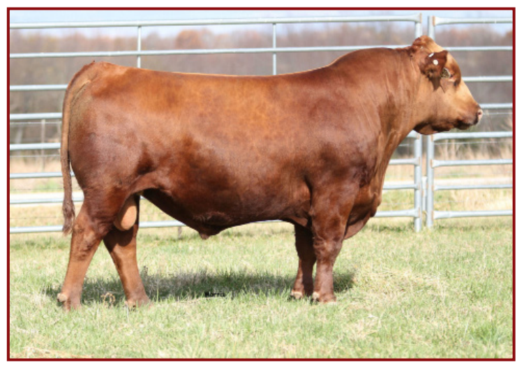
SIRE OF LOT 7 & 9 - BROWN PRA PATRIOT G6291