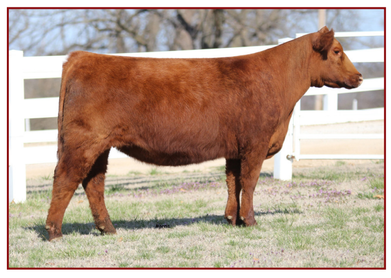
LOT 20 - TW 674D RITA 250K