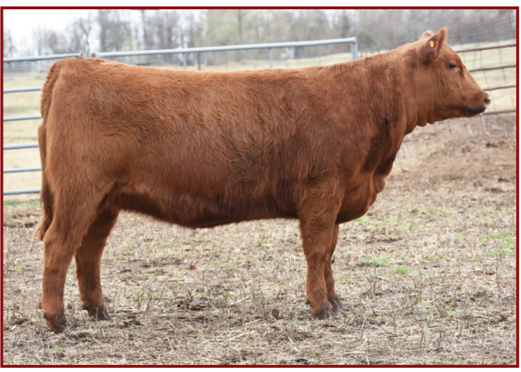
LOT 32 - SGC PERSUASION 5K

Fall bred heifer, combines the performance of her sire MOV'N ON, with the maternal predictability of her maternal grandsire CONQUEST, resulting in a wonderfully balanced and practical brood cow prospect. She also stems from the "809" cow family which has stood the test of time at our place, with exceptional fertility, mothering ability, and maternal performance. Now is the time to add quality females to your herd. Registered Category 3 (75% AR and 25% GV). Resulting mating will be registered 1B. A.I. bred to SRJJ Untapped 5047 (RAAA#3470791) on 12/04/2023 and due on 9/12/2024.