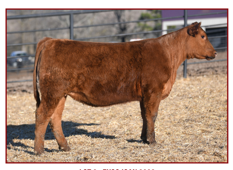
LOT 6 - EXCC JOAN 3009