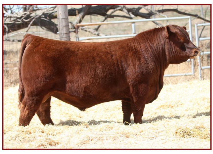
SERVICE SIRE - RED SIX MILE MOSSY OAK 175H