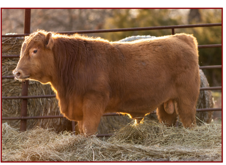
LOT 65 - DRYE ATOMIC L33

L33 is a surefire calving ease prospect with big time EPD profile. He combines a 69# with a 726# WW!. Top 17% CED, top 23% BW, top 14% WW, top 10% YW, top 8% ADG, top 27% MILK, top 9% HPG, top 17% CEM, 123% MARB, 26% CW & 27% REA!