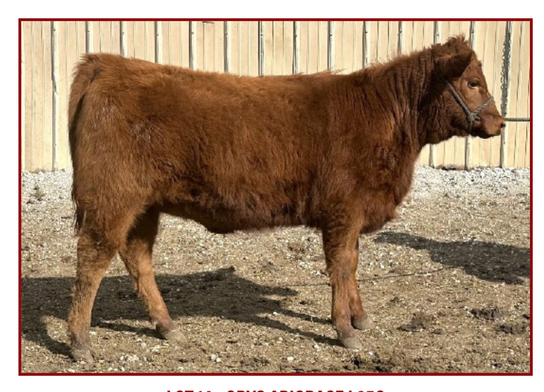
LOT 14 - ORYS ABIGRACE L85C