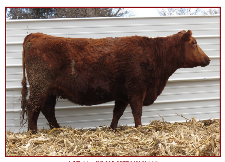
LOT 46 - JYJ MS MERLIN H407