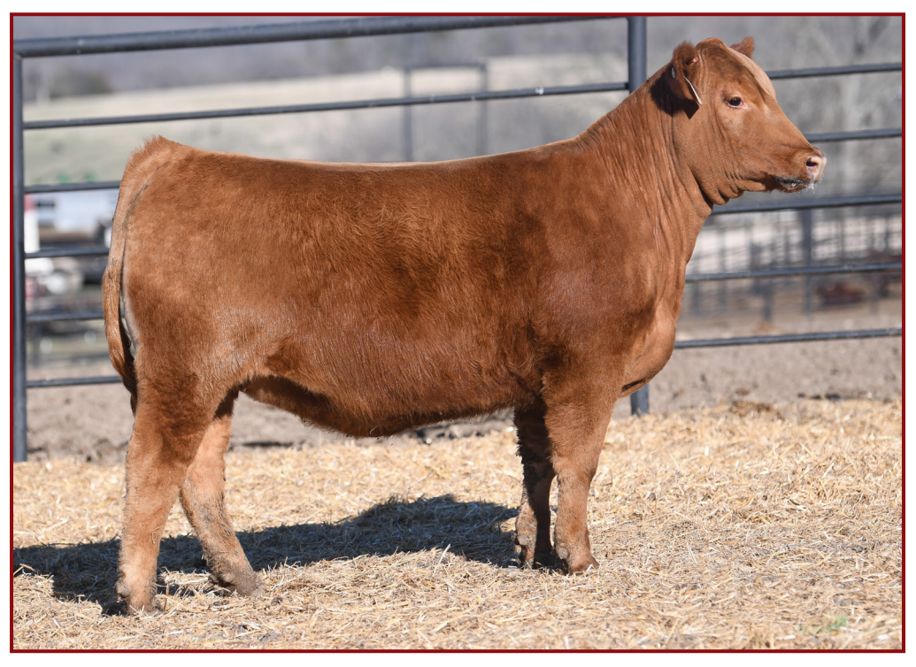
LOT 22 - EXCC MISS CRICKET 2099