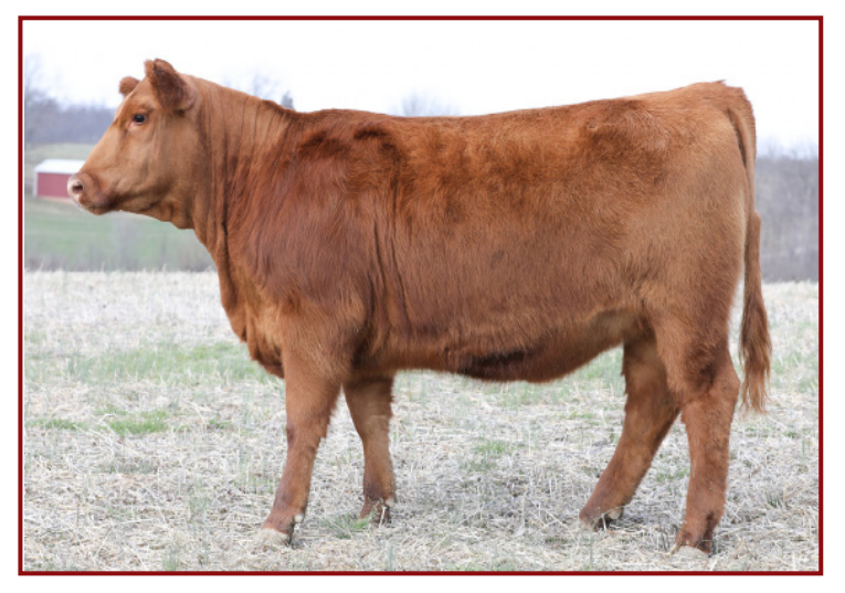
LOT 25 - BROOKSIDE'S KARUBA K33

K33 is a deep bodied Fusion daughter with maternal power that came straight out of our replacement pen. This is a moderate framed, easy fleshing heifer that will thrive on Missouri fescue. Study her on sale day and you will come to appreciate the massive rib and free moving skeleton of this heifer. Karuba offers a very balanced EPD profile and is backed by Andras Fusion and our Karuba R17A cow. These are predictable, dependable genetics. Confirmed AI bred to Bieber CL energize F121 for a 10/02/24 calf, this heifer will be a phenomenal addition to any fall calving herd.