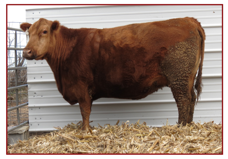
LOT 43 - RJOH 333D

RJOH 333D is a 99.9% red angus cow that has a top 13% in HB and top 10% in stay with a weaning ratio of 117. RJOH 333D is a moderate frame that is long made and big hipped. She was exposed to CB Red Power 2160 re#4583001 from 11-28-23 to 2-18-24 due to calve around the second week of September.