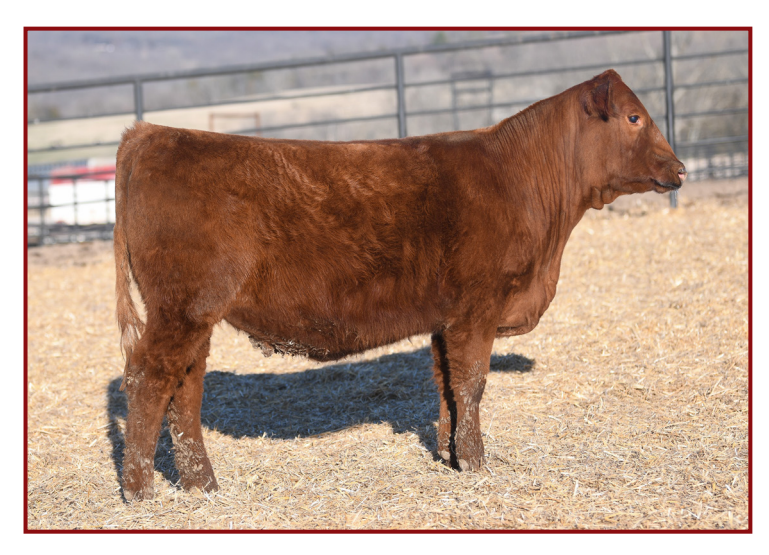
LOT 10 - EXCC FAYE 3064

Faye 3064 is well balanced, stylish made heifer with loads of body and a great front end. Very complete heifer!