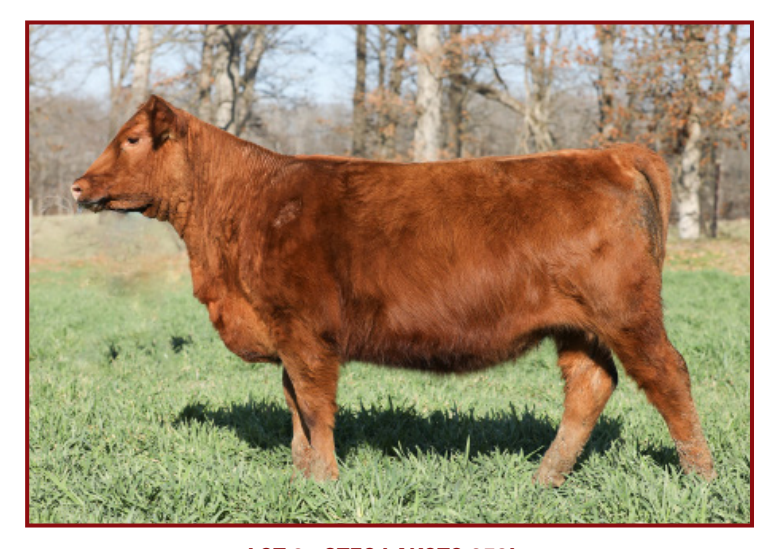
LOT 8 - STFC LAKOTO 953L