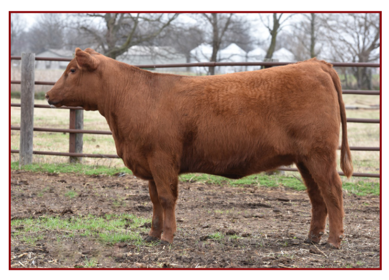
LOT 5 - SGC DINA 3L