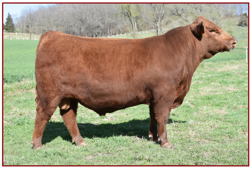
LOT 56 - SGC MERLIN 1L

SGC MERLIN 1L comes from a mating that packs calving ease, growth and carcass quality into a very attractive package. Show-Me-Select calving ease and top 2% WW, top 4% YW and carcass traits to boot. Lots of eye appeal. Halter broke and broke to a hot wire.