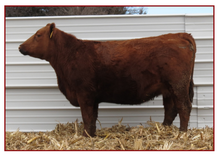
LOT 47 - FEDDES BLOCKANA E54-139