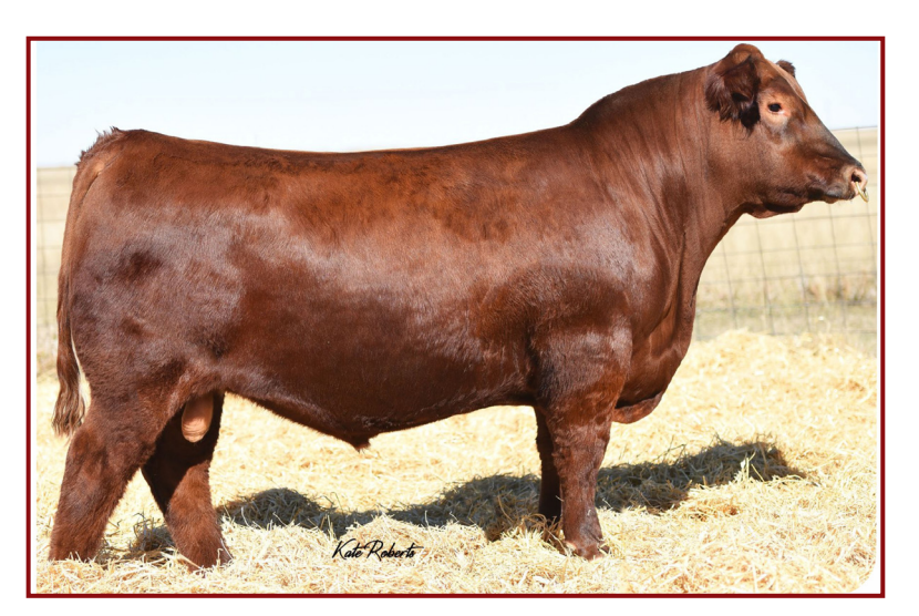
SIRE OF LOT 39 - ROGERS JIBA G910

Stylish, wide-bodied and correct from every angle, this young cow has a stunning maternal look. Clean fronted, big hipped with an ample amount of body depth and muscle expression. Her late-November heifer calf at side, (Reg # 4898332) by WISCMO GROWTH STOCK 01H combines the performance and power of her sire with the calving ease and maternal traits of her maternal grandsire, GMRA TESLA. PE'd to MLK CRK SENECA 9232 (4144008) from 12/14/23 to 2/21/24. Breeding status will be confirmed before sale.