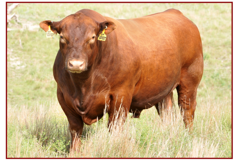
SIRE OF LOT 57 - LACY COLLUSION 115F

115K is stout age-advantaged bull that has been a standout since birth. An ET son of Collusion, who's full sister was a crowd favorite & the top selling open heifer in the 2023 Show-Me Reds Sale selling to Veto Valley Farms.