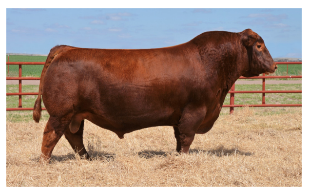
SERVICE SIRE - BLAIRS BINGO 581B Lots 300-304 and 322 & 323