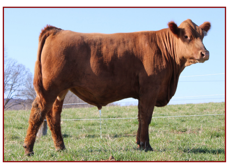
LOT 62 - KFF MULBERRY 301