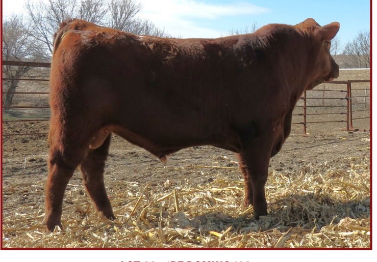
LOT 63 - 1PF DOMINO 103

1PF Domino 103 is a performance kind of bull out of MCL Domino 9545 and on the bottom side Jag Design 331A. 1PF Domino is a thick heavy muscled moderate frame bull that has a top 3% WW top 5% YW top 12% ADG top 15% CW top 14% Fat and a 112 weaning ratio. He is the kind that will help put pounds on your calves for market. Born and raised on fescue and is semen tested and ready to go to work