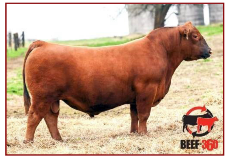
SIRE OF LOT 3 - LACY MOV'N ON 417 063G