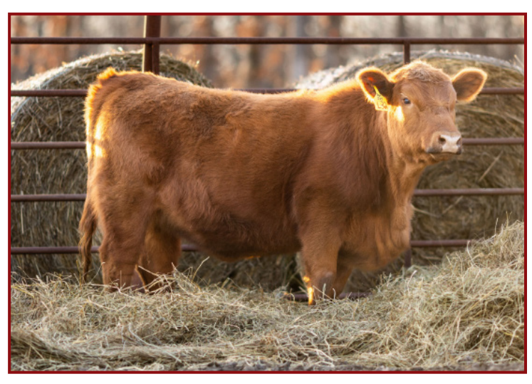
LOT 7 - DRYE LUCAS L32