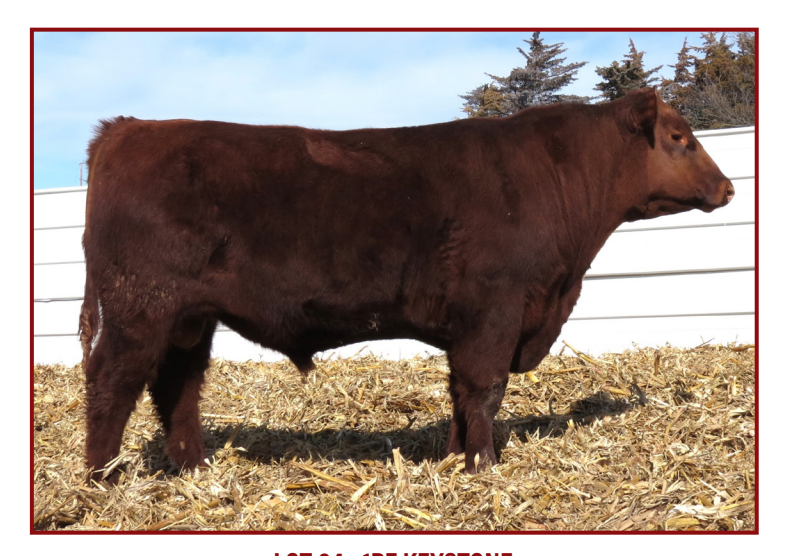
LOT 64 - 1PF KEYSTONE

Check out 1PF Keystone, he is a dark red powerful growth bull sired by Lacy 1776 002D and on the bottom side out of the great Blockana cow family with his grand dam being Feddes Blockana X179 the late power house Donor that we had the privilege to own. Keystone has a top 6% WW, top 7% YW, top 10% ADG, top 10% Milk and a weaning ratio of 110. With these high feeder calf prices keystone will help you get pounds on the scale. Born and raised on Fescue, semen tested and ready. Retaning 1/3 semen intrest