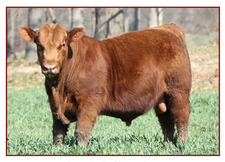
LOT 60 - STFC JESSE JAMES 138L