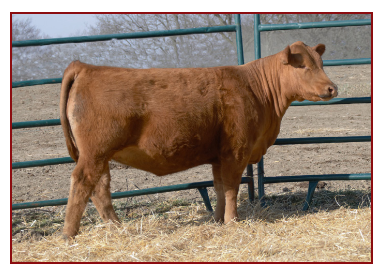
LOT 3 - BRAX SPLIT ROCK 334