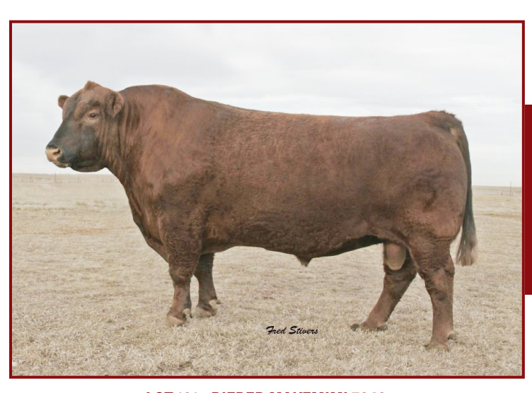
LOT 101 - BIEBER MAKEMIMI 7249