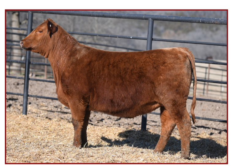
LOT 26 - EXCC CRYSTAL 2109