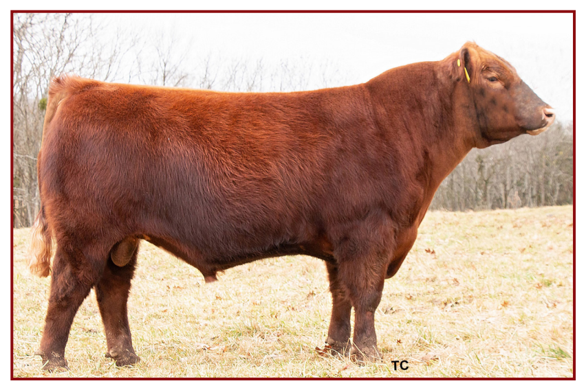
LOT 55 - SL 9117 GUIDANCE 2204