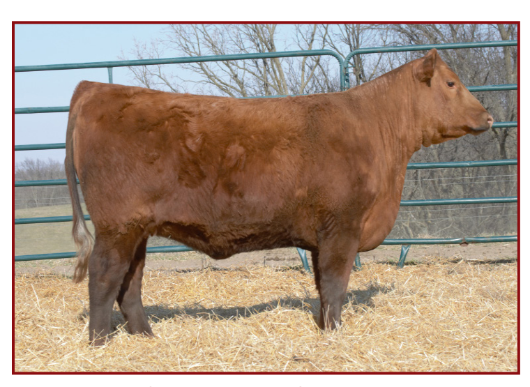
LOT 27 - BRAX LEADING JEWEL 2206