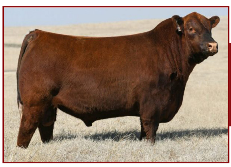
LOT 102 - MANN RED BOX 55C