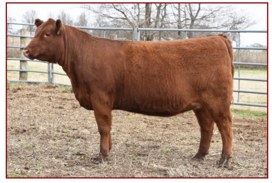
LOT 2 - SGC MISS ESSENCE 6L

Lots 1 & 2 are a pair of sweet full sisters sired by PZC TMAS FireStorm 1800 ET and out of a direct daughter of XO Crowfoot 0102X. Both heifers are clean fronted females with lots of volume, a ton of eye appeal as well as a stunning show ring appearance. If you are looking for a show heifer make sure you look them up. Both heifers come halter broke and very gentle.